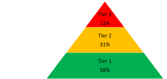
Model of Tiered Intervention

3.4 An assessment of expenditure was undertaken during 2022/23, and repeated in 2023/24, using the model of tiered intervention illustrated below, allowing a greater understanding of spend in categories of Primary, Early and Response Intervention across the organisation. This, in turn, supports prioritisation of services and projects which seek to prevent demand and harm. An analysis of the proposed 2023/24 commissioning intentions shows a significant majority are focused on services predominantly focused at Tier 1 (Prevention) or Tier 2 (Early Intervention).