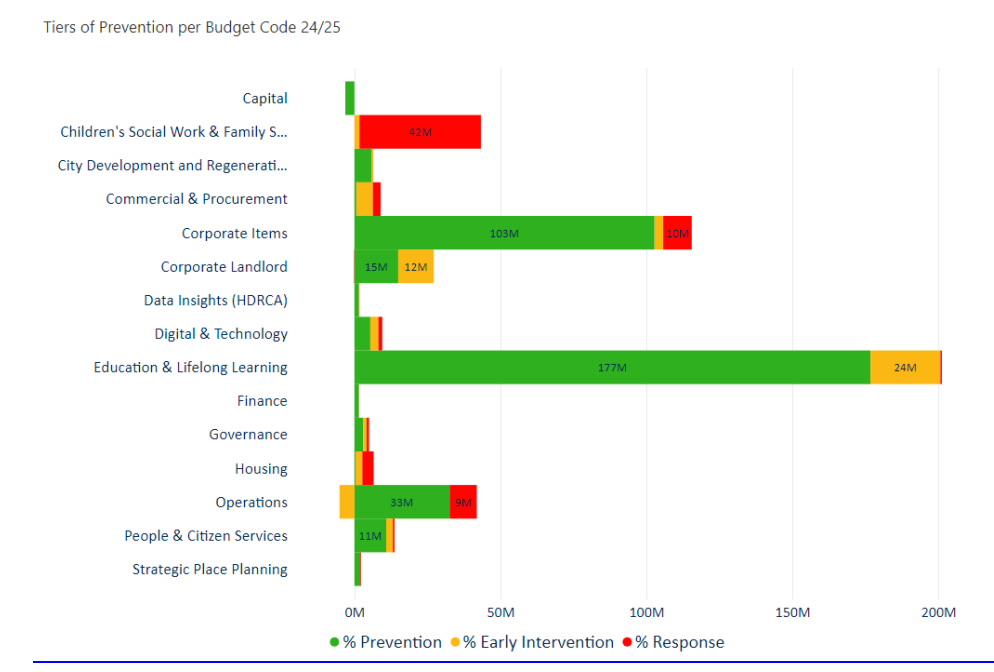
Budget Allocation Per Cluster by Tiered Prevention Model